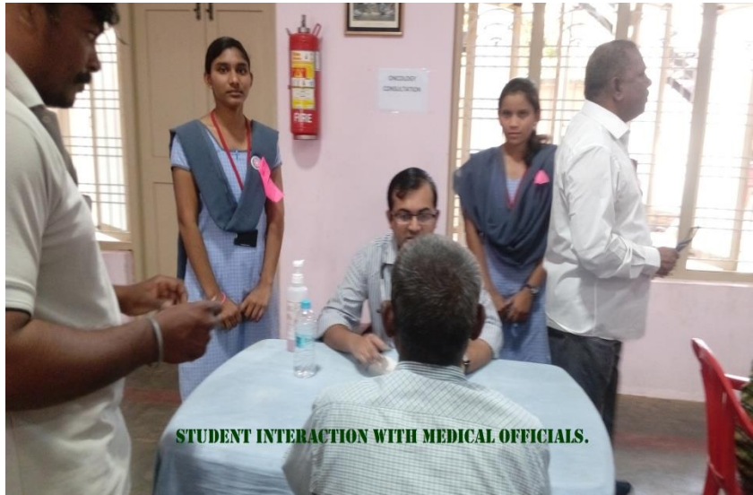
STUDENT INTERACTION WITH MEDICAL OFFICIALS.