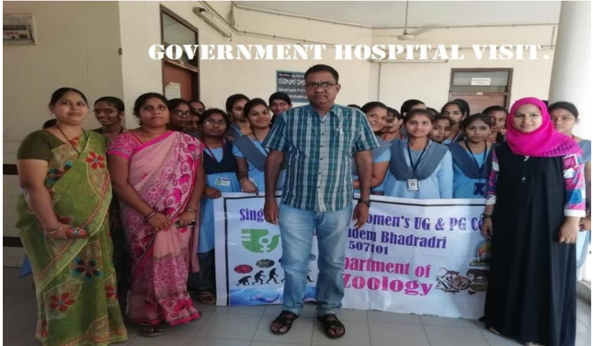
GOVERNMENT HOSPITAL VISIT.