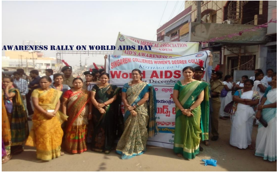
AWARENESS RALLY ON WORLD AIDS DAY