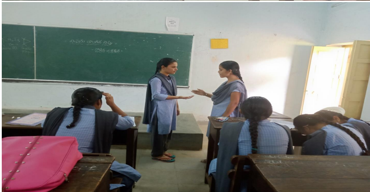
2. A class room seminar by students on the topic “ Ramayana Mahabharatha kathala Vivarana” on 18.02.2020